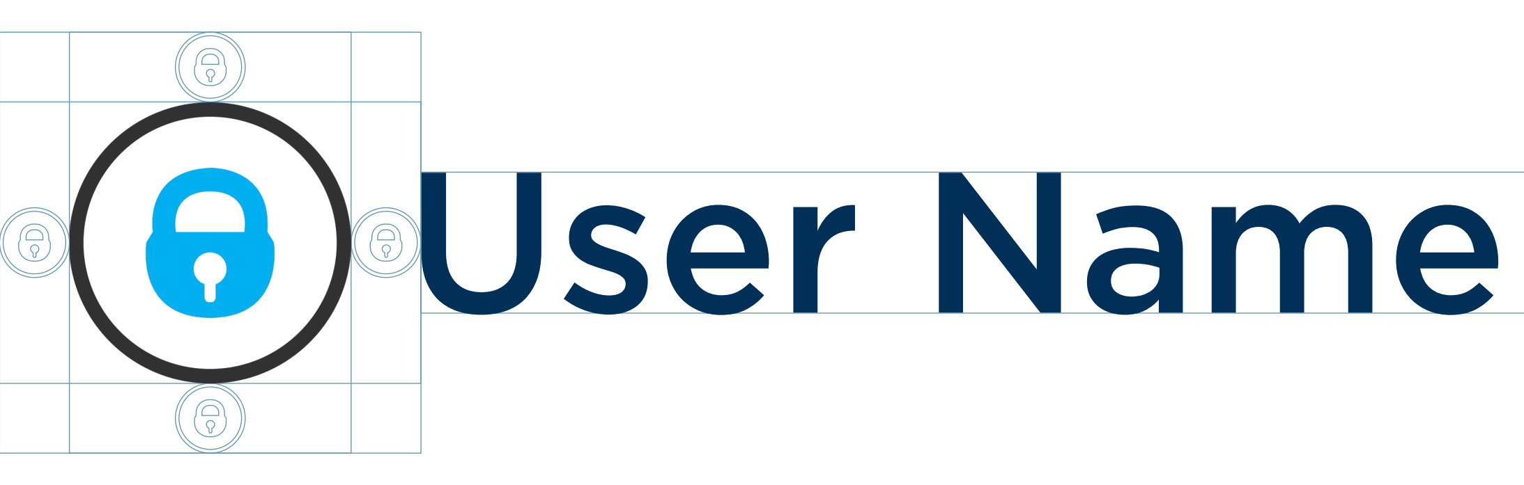
Logo clear space

Feel free to use a typeface that's from your brand's design system.