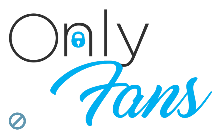
DO NOT —

DO NOT — Fill with different colors or patterns